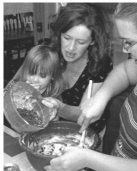
Making cookies at Stepping Stones

MAPS Shelter Services: In order to serve women and children in a safe, homelike environment, our Bangor shelter relocated this year. Plans to move our Portland-area shelter were launched as well. All families under our new shelter model now receive 24-hour support services, the benefits of communal, mutually supportive family-style